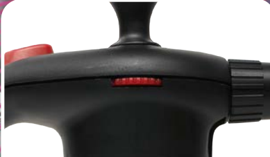
Built-in pressure relief valve.

Designed for use with wax and grease remover type products.