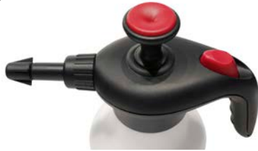
Completely enclosed to protect mechanisms from dust & dirt.