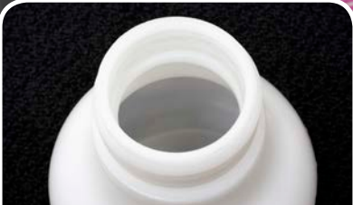
Large capacity canister & opening for easy filling.